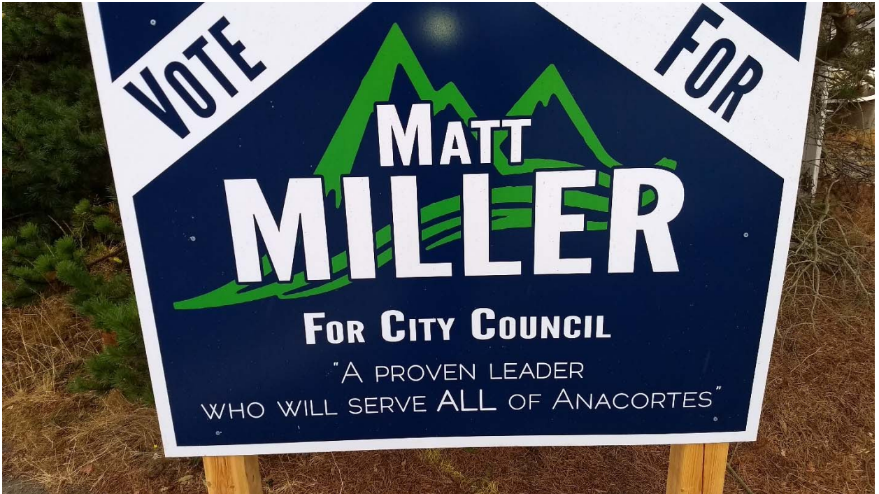
Close-up of 48"x36" Aluminum sign on 2113 37TH STREET.