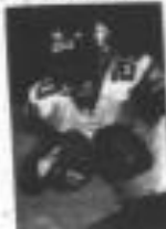
San Diego 24, Seattle 14